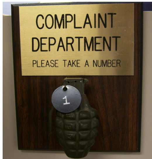
It could be worse. Like the EDramatica offended page... (Daily Bull is not responsible for resulting scarring.)

So remember – whenever you have a teacher that you want to bitch about, just remind yourself that it could be worse. You could have to write up every time someone bitches and whines. 🐘